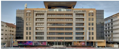
Atlantis The Palm/Donatello Hotels & Resorts or Similar